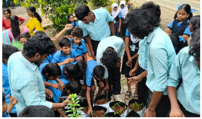
World Environment Day – Tree Planting by NSS