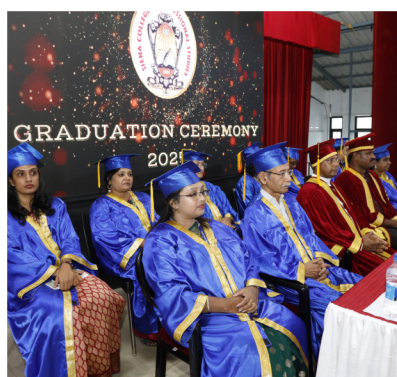
A proud milestone marking the beginning of new journeys and brighter futures!