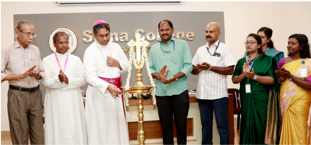
Opening doors to opportunities and shaping promising careers.