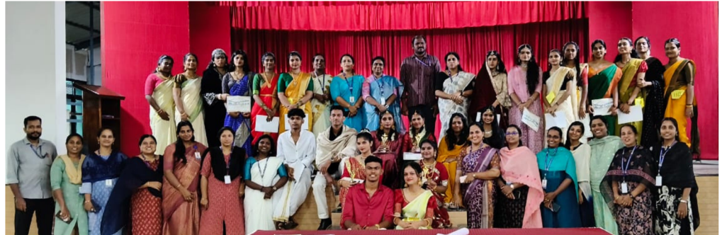
Celebrating diversity, culture, and the beauty of traditions, Moments from Vividha – Ethnic Day