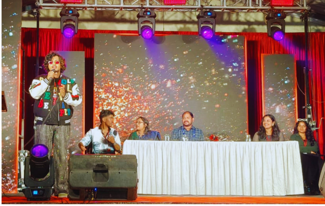
A day of unity, leadership, and vibrant student spirit