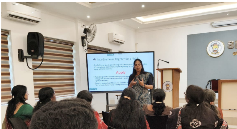
Empowering educators through learning, growth, and professional excellence