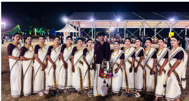
Grace in rhythm, excellence in tradition, an A Grade moment of pride!

The Thiruvathira Team of the college secured A Grade at INAMAI 2026, the Intercollegiate Kalolsavam of Mahatma Gandhi University. This remarkable achievement reflects the talent, dedication, and hard work of the students. The institution extends its sincere appreciation to the teachers for their guidance and expresses heartfelt gratitude to the Management for their constant support and encouragement in promoting cultural excellence.